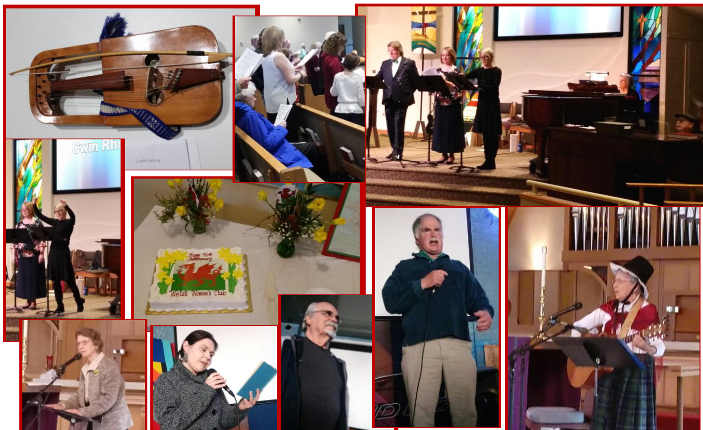
PHOTO GALLERY: DES MOINES GYMANFA GANU, SEATTLE ST. DAVID'S DAY CELEBRATION, & TACOMA NOSON LAWEN

Y Ddolen/The Link is a quarterly newsletter for the Puget Sound Welsh Association