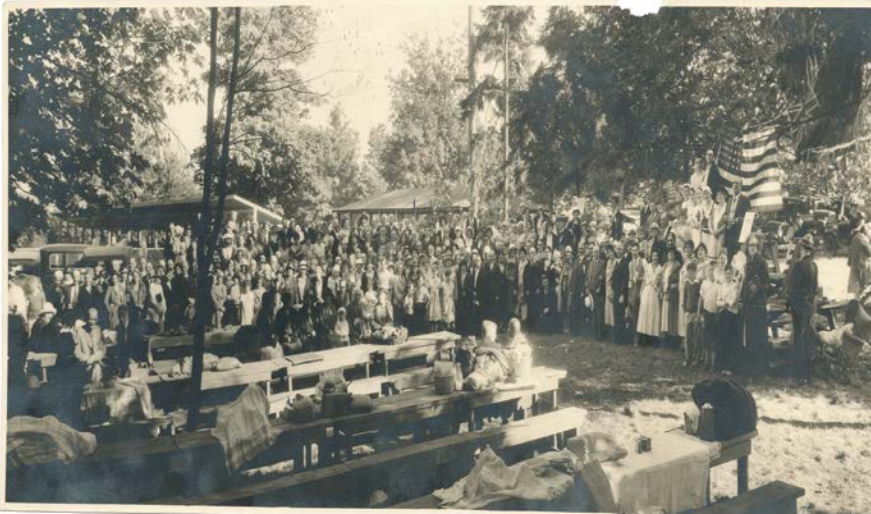
Woodland Park Welsh Picnic July 4, 1930