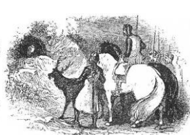
Mabinogion Dream of Maxen Wledig courtesy of Gutenberg.org