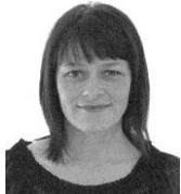
Nerys Jones