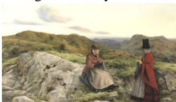
William-Dyce painting