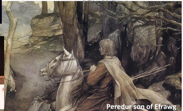
Peredur son of Efrog