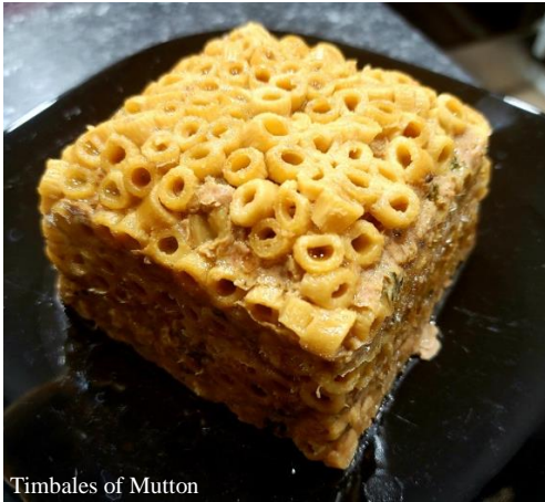
Timbales of Mutton

If you have read the previous Y Ddolen , I wrote about some recipes my great-grandmother had written down about 105 to 110 years ago. These were recipes that had been written in a way that reminded me how much technology changed in the 20 th century, and how much of a guessing game making these recipes could be. Terminology like slow oven, place pan on fire, or even cook until done.